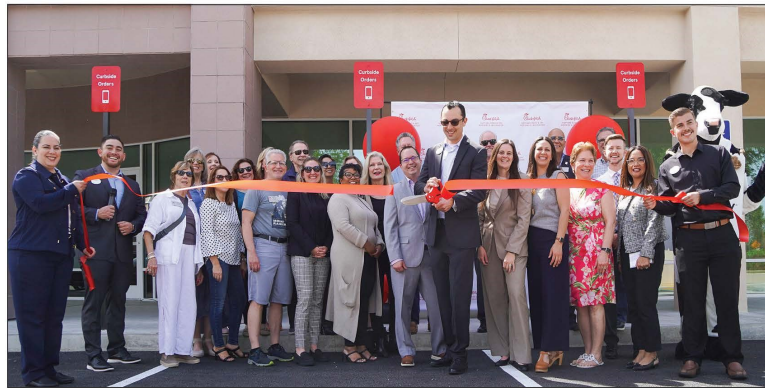
Friends, family, and members of the Pleasanton community celebrated the opening of Chick-fil-A Hopyard & Ingleswood Road with an official Ribbon Cutting ceremony outside the restaurant.