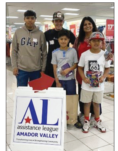
School supply drive in partnership with Assistance League of Amador Valley.

ter students and books to foster kids to read to their biological parents. Thank you everyone for their contributions to the drive, we were able to collect a lot! Near the end of this month, we will also be volunteering with ALAV for their Operation School Bell® - Clothing the Children program, their signature philanthropic program where