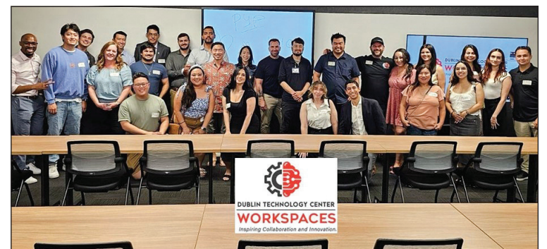
Young Professionals from Dublin and Pleasanton chambers networking at Dublin Technology Center Workspaces.

In other news, we finished a Joint Networking Mixer with the collaboration of the Dublin Chamber of Commerce at the Dublin Technology Center Workspaces