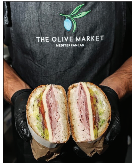
Delicious Mediterranean-style deli sandwiches featuring 14-month aged prosciutto di Parma, Italian mortadella, salami, and more, or savor a gourmet vegetarian option. There's something for everyone at The Olive Market!

Our family is full of culture, and we wanted to bring that flavor to you. We continue to source and update our inventory with community & diversity in mind. With that, we can't wait to see you in our store soon! Located at 6455 Owens Drive, Suite D, Pleasanton CA 94588. Visit us at www.theolive.market . Follow us on Instagram for the latest updates @theolivemm.