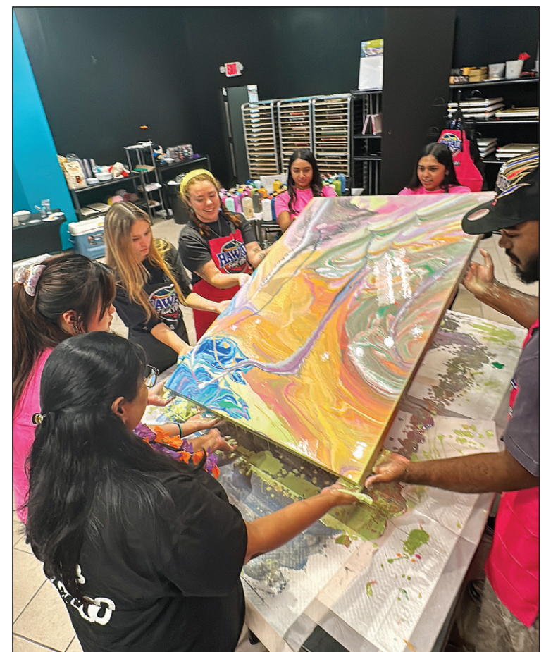
Experience the camaraderie, the joy of the creative process, and the thrill of experimenting with new techniques at Hawaii Fluid Art!

Come, create, and experience art like never before at Hawaii Fluid Art. Mahalo!