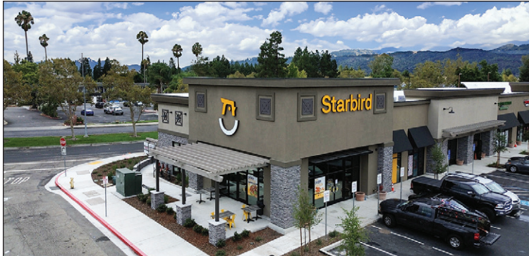
Visit the Pleasanton location at 6455 Owens Drive, Suite 5A.