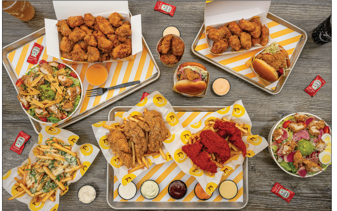
Every vegetable is freshly chopped in-house, dressings are made daily, and the chicken – always fresh – remains free of antibiotics.

Beyond its culinary excellence, Starbird takes immense pride in being a positive force in the Bay Area communities it serves. By supporting and recognizing the efforts of frontline workers, teachers, and other impactful community members, Starbird strives to make a meaningful difference.