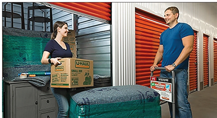
On-site storage units are climate controlled to keep your items protected from weather and humidity.

Pleasanton U-Haul – 5555 Sunol Blvd. (510) 632-6828