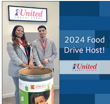
Donate food for Alameda County Community Food bank at our branches all year.