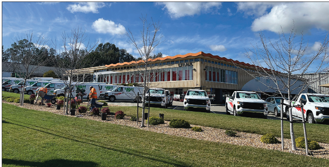
Pleasanton U-Haul, 5555 Sunol Blvd., Pleasanton - (510) 632-6828

Our prices are always the lowest in the business. We also make sure