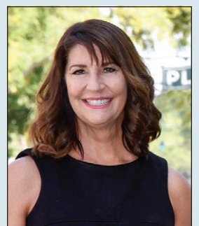
Mayor Karla Brown City of Pleasanton