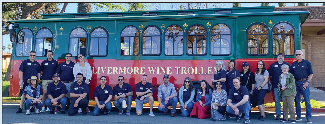
One of the highlights of Recreation Day was a tour of the Alameda County Fairgrounds