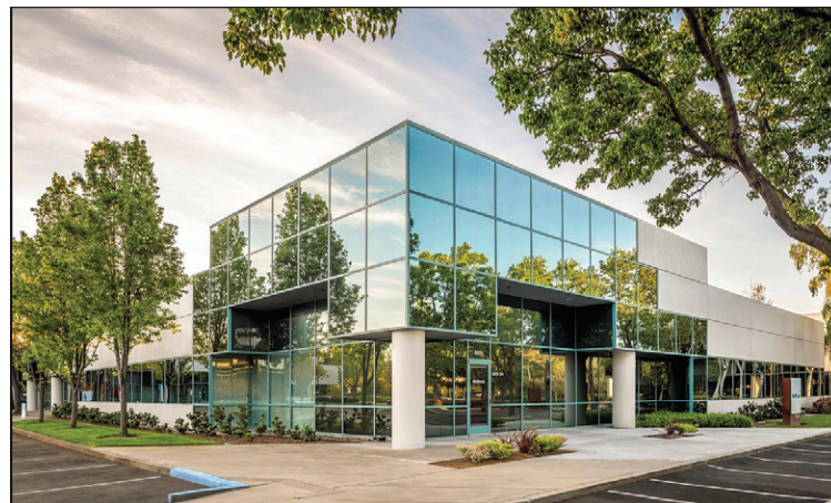
Bay Area Fencing Club, 5870 Stoneridge Drive, Suite 6, Pleasanton

Contact: Lisa Posthumus, Nathan Milgram at 925-236-0280 • info@bayareafencing.club • www.BayAreaFencing.Club