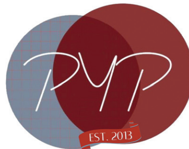
Pleasanton Young Professionals