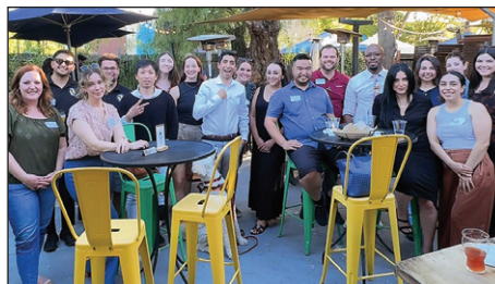
June Mixer at McKay's Taphouse and Beer Garden

This year, we are collaborating with the Assistance League of Amador Valley, a non-profit organization who does hands-on volunteerism serving children, teens, and seniors, as well as aiding in education for low-income