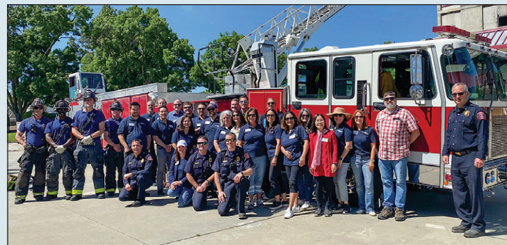
The class had the opportunity to climb the ladder on this tiller truck.