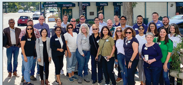
Class in front of 288 Main Street. This building, built in 1864, was once a Wells Fargo stagecoach stop.