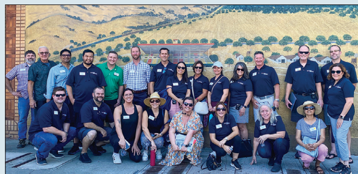
Walking tour of downtown during Pleasanton: Then & Now