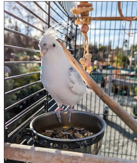
Western Garden Nursery

"Although time has a way of changing things, one thing remains constant, our commitment to top quality plants and customer service."